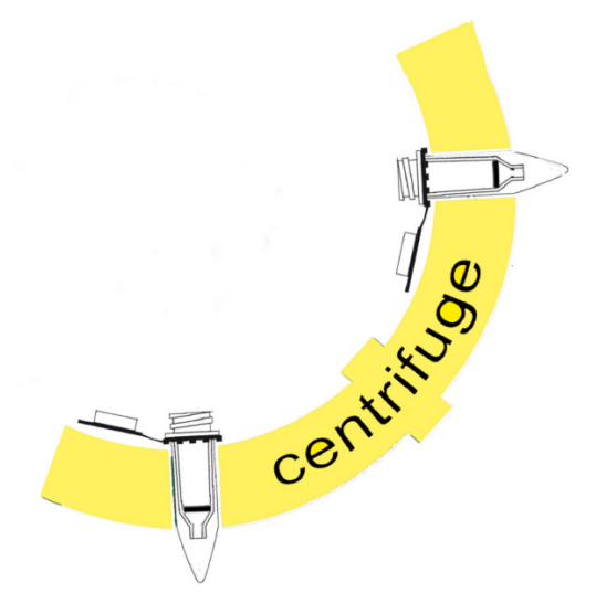
Mobicols can be centrifuged (fit into 1.5 ml or 2 2 ml tubes)

MoBiTec GmbH, Germany ● Phone: +49 551 70722 0 ● Fax: +49 551 70722 22 ● E-Mail: info@mobitec.com ● www.mobitec.com